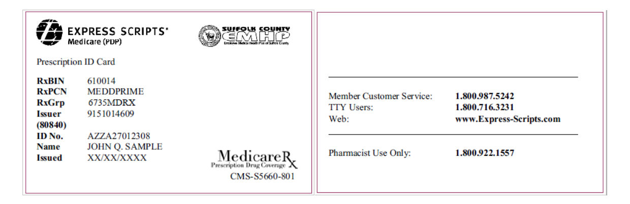
EMHP Medicare Part D Prescription Drug Program Card (only contains prescription drug information)

• You will receive a prescription only ID Card, which you will use at the PDP network pharmacies. This card is included in your Welcome Kit from Express Scripts Medicare<sup>®</sup> (PDP) Please see example below: